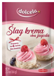
PODRAVKA 01080A B692S8/WHIP.CREAM POWDER STRAW. 18/66g UPC - 3850104216923