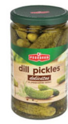
PODRAVKA 01029 DILL PICKLES 12/670g UPC - 842826000631