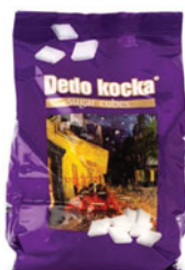
DAMIREX 56001 DEDO SE CER U KOCKI PVC" 10/1kg UPC - 3871110000047