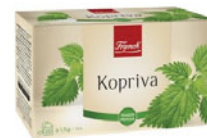
FRANCK 02122 CAJ KOPRIVA (NETTLE TEA) 20/30g UPC - 3858881086760