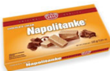
KRAS 03530 CHOCOLATE CREAM WAFERS 12/330g UPC - 733426025288