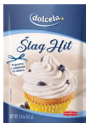
PODRAVKA 01044A B690S8/WHIP.TOPPING POWDER HIT 20/42g UPC - 3850104216909