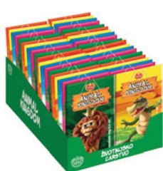
KRAS 03030M ANIMAL KINGDOM 15g 240/15g UPC - 3850102114269