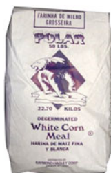
POLAR 78001 WHITE CORN FLOUR 50 LBS BAGS UPC -