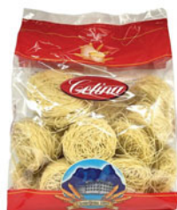
CETINA 39015 FINE NOODLES NEST #67 15/400g UPC - 3858881682405