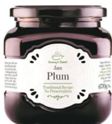
FOODLAND 24505 GRANNY SECRET PLUM JAM 6/670g UPC - 8606011032959