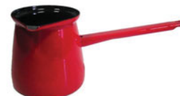
EMO 88010M COFFEE POTS 12/6cm UPC - 3838908026757