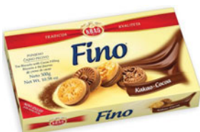
KRASM 03081 FINO KAKAO 12/300g (92264101) UPC - 3850102311484