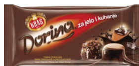
KRAS 03027 DORINA COKOLADA ZA KUHANJE 20/100g UPC - 3850102110605