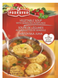
PODRAVKA 01004A VEGET.S.WITH SEM.DUMP. 10/58g (A17558) UPC - 842826000532