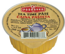
PODRAVKA 01198 (2X30) TEA TIME PATE 60/50g UPC - 733436010878