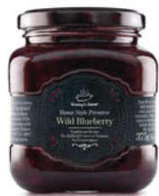
FOODLAND 24523 GRANNY SECRET W.BLUEBERRY JAM 6/375g UPC -