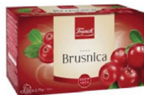
FRANCK 02091 BRUSNICA CAJ 20/55g UPC - 3858881083769