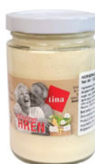
TINA 4 HORSERADISH SAUCE (HREN) 12/200g UPC - 3830000993005