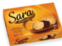
KRASM 03464A SARA CLASSIC 16/220g UPC - 3870450001707