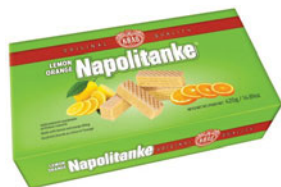
KRAS 03559 *BLOK* NAPOLITANKE LEMON-ORANGE 12/420g UPC - 3850102326235