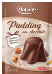
PODRAVKA 01063A J481S8/PUDDING CHOCOLATE 18/45g UPC - 3850104216718