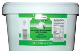
PHILI 15006 BULGARIAN SHEEP'S MILK CHEESE 12/0.9Kg UPC - 733426014978