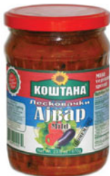
KOSTANA 58130 OLD VILLAGE AJVAR MILD 12/670g UPC - 733426014534