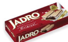
SLOBODA 04001 JADRO WAFERS 14/430g UPC - 3850120295438