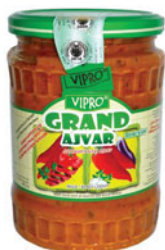
VIPRO 58353 'VIPRO AJVER GRAND 12/540g UPC - 5310149004162