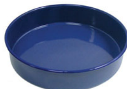
EMO 88013 DEEP BAKING TRAY 128/28cm- 6pcs UPC - 3838908028331