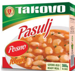
TAKOVO 25040A POSNI PASULJ 8/300g UPC - 3601900304230