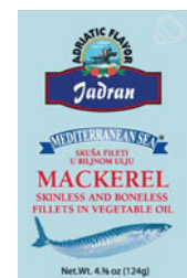
ORBE 54205 MACKEREL SKNLS FILLET IN VEG OIL 50/124g UPC - 73342602722