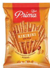
STARK 74028A PRIMA SALTY PASTRY WITH PEA- NUTS 30/100g UPC -