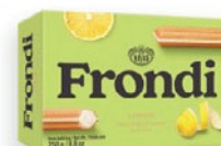
KRASM 03639 FRONDI MAXI LEMON WAFER 28/250g UPC - 3870450001172