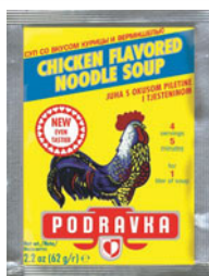
PODRAVKA 01001A CHICKEN NOODLE SOUP 35/62g (A13358) UPC - 842826000709