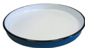
EMO 88005 SHALLOW BAKING TRAY 129/32cm-6pcs UPC - 3838908022735