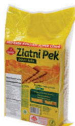
BAMBI 24023 ZLATNI PEK 7/750g UPC - 8600043006360