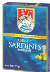
ADRIA 22031 SARDINE IN OLIVE OIL 30/115G / F09558 UPC - 842826000914