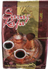
KLAS 34060 SARAJ KAVA 16/500g UPC - 3870004005908