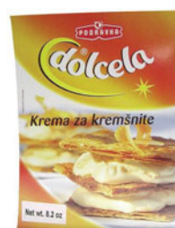
PODRAVKA 01053 'CREAM FOR CREAMPIE 7/230g (7581S8) UPC - 3850104075810