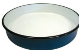
EMO 88001 DEEP BAKING TRAY 128/32cm- 6pcs UPC - 3838908022704