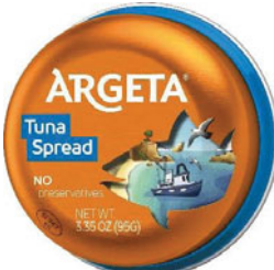
KOLINSKA 98024A (14 PACK) TUNA PATE ARGETA 14/95g UPC -