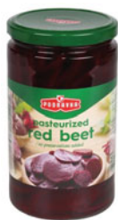
PODRAVKA 01076 CIKLA - RED BEET 12/660g UPC - 842826000723