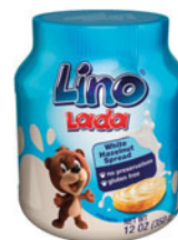
PODRAVKA 01348 LINO LADA MILK 12/350g UPC - 3850104283958