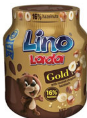
PODRAVKA 01350 LINO LADA GOLD 12/350g UPC - 3856020213572