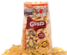
GUSTO 46919 CORN SALTY SNACKS 24/85g UPC - 5941868200087