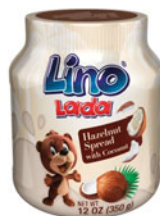
PODRAVKA 01347 LINO LADA KOKOS 12/350g UPC - 3850104284458