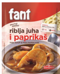
PODRAVKA 01012 SEAS.MIX FOR FISH SOUP 22/60g (A555S8) UPC - 842826000686