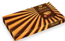
KRAS 03041A BAJADERA 12/200g UPC - 3850102230055