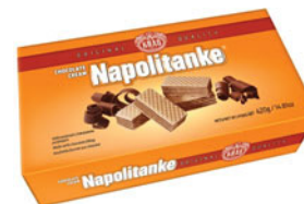
KRAS 03558 *BLOK* NAPOLITANKE CHOC.CREAM 12/420g UPC - 3850102326143