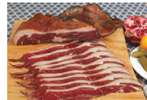
BS 63061 SMOKED BACON (DALMATINSKA PANCETA) LB UPC -