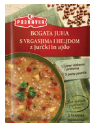
PODRAVKA 01381 HEARTY SOUP POR.MUSH.AND BUCKWH 15/70g UPC - 3856020218850