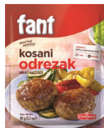
PODRAVKA 01013A SEAS.MIX FOR MEAT PATTIES 14/90g(A577S8) UPC - 842826000563