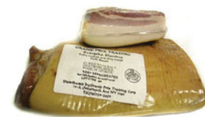
GP 0001 SMOKED BACON( SVINJSKA SLA- NINA) UPC -