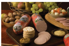
BS 63084 VEAL BOLOGNA (TELECI PARIZER) 2lb UPC -