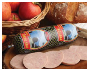
BS 63005 COOKED VEAL SAUSAGE (TELECA TIROLSKA) 2LB UPC -