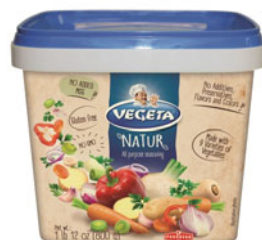
PODRAVKA 01364 VEGETA NATUR DOZA 6/800g UPC - 3856020221096