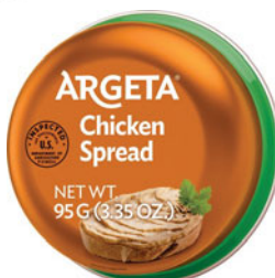
AG 98101 ARGETA CHICKEN SPREAD 48/95g UPC - 733426027565