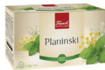
FRANCK 02120 CAJ PLANINSKI (MOUNTAIN TEA) 20/40g UPC - 3858881086791