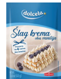
PODRAVKA 01079A B693S8/WHIP.CREAM POWDER VANIL. 20/45g UPC - 3850104216930