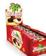
STARK 74001 KREM BANANA COKO MEKI DE-SERT 240/25g UPC - 8600939365700