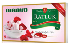
TAKOVO 25011 RATLUK RUZA 12/450g UPC - 8601900605320