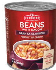
PODRAVKA 01202 BEANS WITH BACON 15/400g UPC - 3850104035746