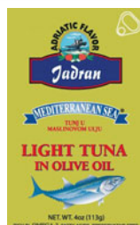
ORBE 54208 LIGHT TUNA IN OLIVE OIL 50/113g UPC - 73342602725