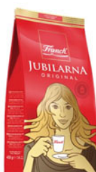
FRANCK 02110 JUBILARNA KAVA MLJEVENA 10/400g UPC - 3858881085596