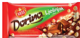
KRAS 03574 DORINA CIJ. LJESNJAK 21/100g NL UPC - 3850102122073