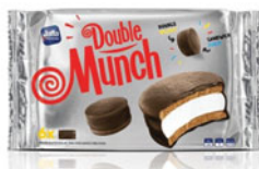
CRVENKA 73033 MUNCHMALLOW DUO 10/133g UPC - 8600114008415