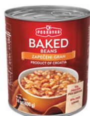
PODRAVKA 01203 BAKED BEANS/ZAPECENI GRAH 15/400g UPC - 3858886465997