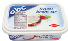
BELJE 99001B "ABC" CHEESE SPREAD 24/100g UPC - 3859888858008