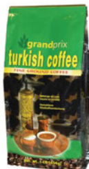
GP 66202 GRAND PRIX TURKISH COFFEE 10x454g UPC - 733426027602