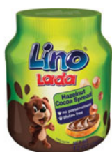
PODRAVKA 01349 LINO LADA NOUGAT 12/350g UPC - 3850104267123