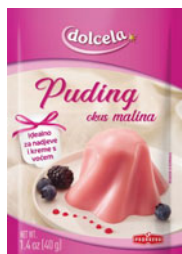
PODRAVKA 01067A B674S8/PUDDING RASPBERRY 18/40g UPC - 3850104216749