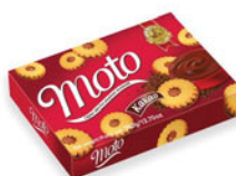
SLOBODA 04012A MOTO KAKAO 12/360g UPC - 3850120200036