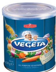
PODRAVKA 01037 VEGETA CANS 24/500g UPC - 842826000198