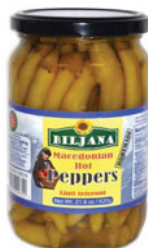
BILJANA 58029 FEFERONI HOT PEPPERS 12/620g UPC - 733426026322