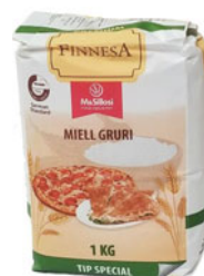
FINESSA 79104 FINESSA MIELL GRURI SPECIAL FLOUR 10/1KG UPC - 3902208390778