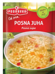
PODRAVKA 01356 FESTIVE SOUP 17/60G UPC - 3850104256028