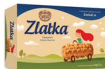
KRASM 03453A ZLATKA 16/220g UPC - 3870450001714