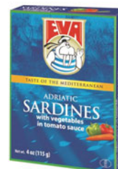
ADRIA 22032 SARDINE W/VEG IN SAUCE 30/115G /F09258 UPC - 842826000907