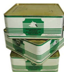
PHILI 15007 BULGARIAN SHEEP'S MILK CHEESE 3/4Kg TIN UPC -