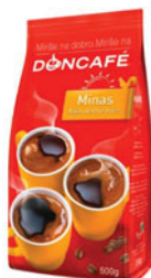
DONCAFE 34520 DONCAFE MINAS 12/500g UPC - 8600101521248