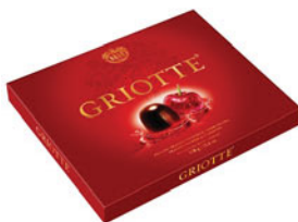
KRAS 03047B GRIOTTE 6/358g UPC - 3850102125845