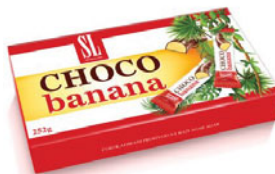
TAKOVO 25021 M2B - CHOCO BANANA 8/252g UPC - 8600946961216