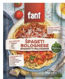
PODRAVKA 01237 SEAS MIX FOR SPAGHETTI BOLO- GNESE 20/60g UPC - 3850104242885