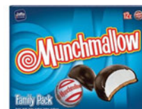
CRVENKA 73032 MUNCHMALLOW FAMILY PACK 12/210g UPC - 8600114001980