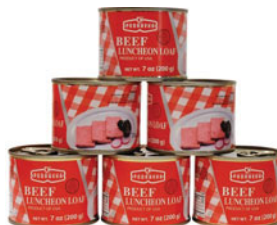
PODRAVKA 01316 BEEF LUNCHEON 24/200g UPC - 842826001751