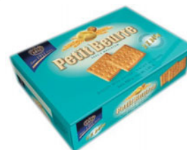
KRAS 03011 PETIT BEURRE 12/480g (31239801) UPC - 3850102311439