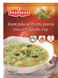
PODRAVKA 01134 CR.OF 9 VEGETABLES SOUP 19/45g (289758) UPC - 842826000457