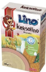
PODRAVKA 01085A KEKSOLINO CEREAL 14/200g (E00658) UPC - 842826000266