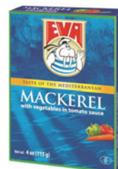
ADRIA 22036 MACKEREL W/ VEGETABLES IN SAUCE 30/115g UPC - 842826000976