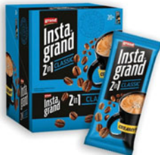
GRAND 34508 GRAND INSTANT COFFEE 2-IN-1 8x20x16g UPC -