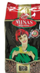
MARCAFFE 66005 (31160) MINAS GROUND COFFEE 12/907g UPC - 3870061000045