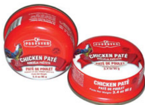
PODRAVKA 01302 PODRAVKA CHICKEN PATE 48/95g UPC - 842826001614