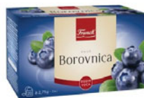
FRANCK 02007 VOCNI CAJ BOROVNICE 20/55g [1413] UPC - 3858881083844