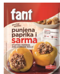
PODRAVKA 01010B S.MIX FOR STUFF.PEPP&CAB 22/60g (A563S8) UPC - 842826000617