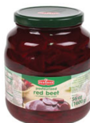
PODRAVKA 01164 CIKLA - RED BEET 6/1600g UPC - 842826000716