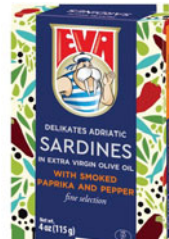
ADRIA 22040 SARDINES WITH SMOKED PEPPERS 30/115g UPC - 385602022734