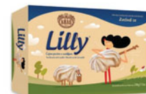
KRASM 03456A LILLY VANILIN 16/220g UPC - 3870450001691