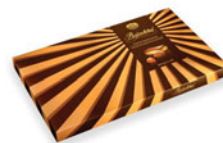
KRAS 03043A BAJADERA CHOCOLATE 6/500g UPC - 3850102230068