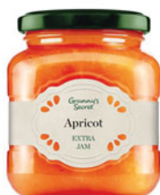
FOODLAND 24545 GRANNY SECRET EXTRA JAM APRI- COT 6/375g UPC -