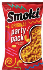
STARK 74017A SMOKI PARTY PACK 16/250g UPC - 8600939507025