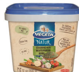
PODRAVKA 01365 VEGETA NATUR MEDITERRANEAN DOZA 6/800g UPC - 3856020221126