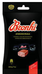
KRAS 03064 BRONHI 15/200g UPC - 3850102215096