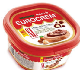
TAKOVO 25003 TAKOVO EUROCREAM 12/500g UPC - 8601900503411