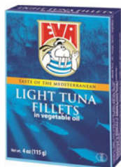
ADRIA 22037 EVA TUNA FILLET IN VEG.OIL 30/115g UPC - 842826000952