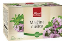
FRANCK 02121 CAJ MAJC DUS (THYME TEA) 20/30g UPC - 3858881086777