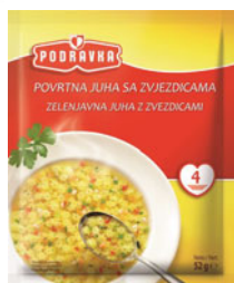
PODRAVKA 01359 VEGETABLE SOUP WITH PASTA STARS 15/52G UPC - 3850104252525