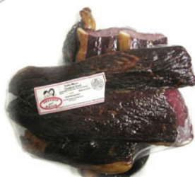
BS 63001 SMOKED BEEF (SUHO MESO) UPC -