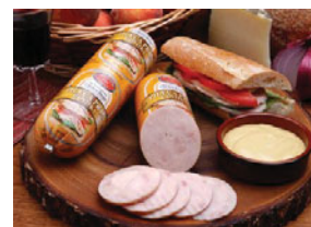
BS 63070 PILECA PRSA (CHICKEN BREAST) 2LB UPC -