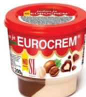
TAKOVO 25014 EUROCREAM JAR 24/200g UPC - 8601900503596