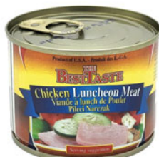
BS 63107 CHICKEN LUNCH LOAF/PILECI NAREZ. 36/200g UPC - 094922973290