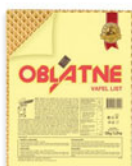
SLOBODA 04014A OBLATNE (TORT WAFERS) 28/150g UPC - 3850120330153