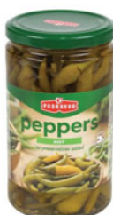
PODRAVKA 01097 FEFERONI HOT 12/630g UPC - 842826000624