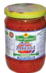
EUROG 58205 ZACUSCA WITH TOMATO 12/540g UPC - 733426025387