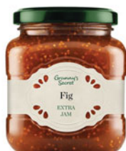
FOODLAND 24542 GRANNY SECRET EXTRA JAM FIG 6/375g UPC -