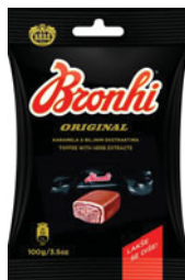
KRAS 03063A 30PAK/ BRONHI 30/100g UPC - 3850102215072