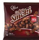
STARK 74007 CHOCO SMOKI STARK 20/40g UPC - 8600939375631