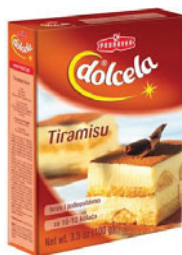
PODRAVKA 01056 TIRAMISU 9/100g (6640S8) UPC - 3850104066405