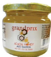
GP 66211 ACACIA HONEY 12/500g UPC - 733426027701