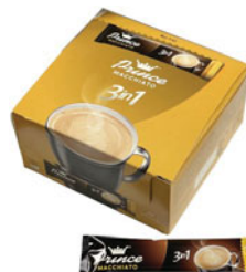
DEVOLLI 79009 PRINCE MACHIATO (3in1) 10x24x15g UPC - 5310233008885