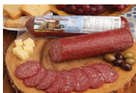
BS 63048 SMOKED BEEF SAUSAGE (GOVEDJA CAJNA) UPC -