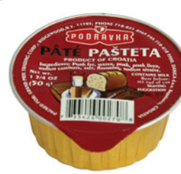
PODRAVKA 01195 (2x30) PATE PASTETA 60/50g UPC - 733426002708