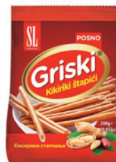
TAKOVO 25102 GRISKI 12/200g UPC - 5310133000729