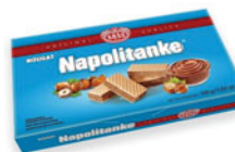
KRAS 03532 NOUGAT WAFERS 12/330g UPC - 733426025325