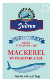
ORBE 54206 MACKEREL IN VEG. OIL 50/124g UPC - 73342602723