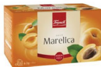
FRANCK 02006 VOCNI CAJ MARELICE 20/60g [1406] UPC - 3850291016283