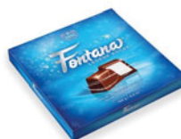
KRAS 03095A FONTANA 12/194g UPC - 3850102505289