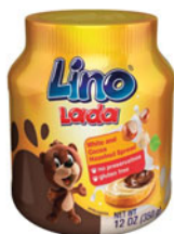
PODRAVKA 01025 LINO LADA DUO SPREAD 12/350g UPC - 842826001010