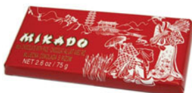
ZVECEVO 06025S 20/75g MIKADO UPC - 3858881064256S