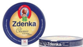
ZDENKA 80001B (SLEEVE) ZDENKA CHEESE 16/140g UPC -