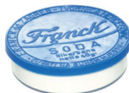
FRANCK 02047 SODA BIKARBONA 50/40g UPC - 3858881081048