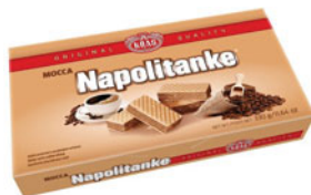
KRAS 03531 MOCCA WAFERS 12/330g UPC - 733426025318