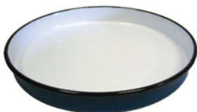
EMO 88004 SHALLOW BAKING TRAY 129/28cm-6pcs UPC - 3838908024616