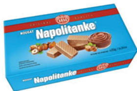
KRAS 03560 *BLOK* NAPOLITANKE NOUGAT 12/420g UPC - 3850102326174