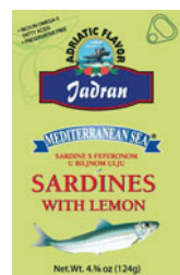
ORBE 54202 SARDINES WITH LEMON IN VEG. OIL 50/124g UPC - 73342602719