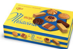
STARK 74004 SPECIAL MJESAVINA 14/450g UPC - 8600939841501