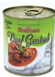
BS 63123 BEEF GOULASH HALAL 24/300g UPC -