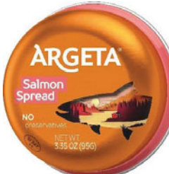
KOLINSKA 98025A (14 PAK) SALMON PATE ARGETA 14/95g UPC -