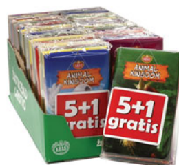
KRAS 03499A ANIMAL K. USA (5+1GR) 14/90g UPC -