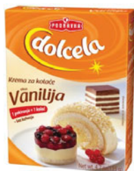
PODRAVKA 01331 DOLCELA VANILLA CRM. FOR CAKES 9/135g UPC - 3850104263637