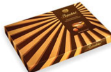
KRAS 03042A BAJADERA CHOCOLATE 12/300g UPC - 3850102230051