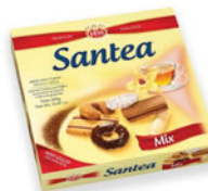
KRASM 03454 SANTEA MIX 12/450g UPC - 3870450000366