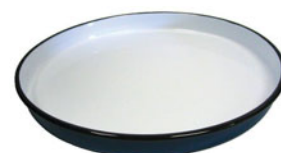
EMO 88006 SHALLOW BAKING TRAY 129/36cm-6pcs UPC - 3838908022742