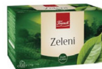
FRANCK 02010 ZELENI CAJ 20/35g UPC - 3858881083745