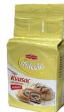
PODRAVKA 01337 DOLCELA INSTANT DRY YEAST 30/100g UPC - 3850104266034