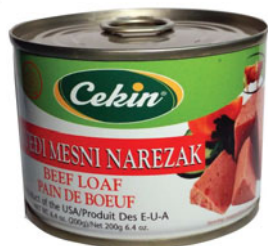
CEKIN 97602 BEEF LUNCHEON LOAF 36/200g UPC - 733426014398.