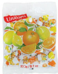
KRAS 03098 UNIC.OR.LEM.CANDY 20/275g UPC - 733426012455