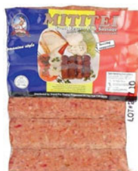
BS 63091 MITITEI ROMANIAN STYLE SAUSAGE 2 LB UPC -