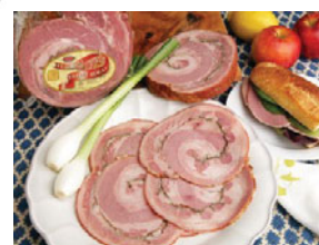
BS 63007 TELECI ROLAT (VEAL ROLL) UPC -