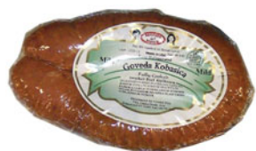
BS 63040 COOKED BEEF SAUSAGE ( GOVEDZA KOBASICA) UPC -