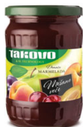
TAKOVO 25095 TAKOVO MIXED FRUIT MAR- MELADE 6/700g UPC - 8601900002402