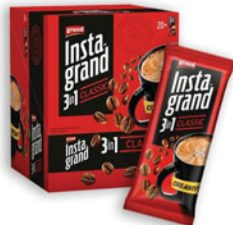
GRAND 34509 GRAND INSTANT COFFEE 3-IN-1 8x20x20g UPC - 8606018311842