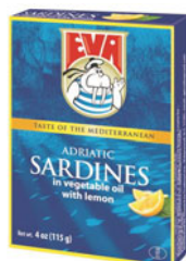
ADRIA 22033 SARDINES WITH LEMON 30/115g / F09458 UPC - 842826000969