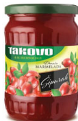
TAKOVO 25097 TAKOVO ROSEHIP MARMELADE 6/700g UPC - 8601900002426