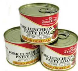
PODRAVKA 01024 PORK LUNCHEON PATTY LOAF 30/200g UPC - 733426002500