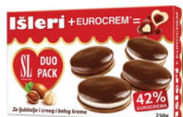
TAKOVO 25060 ISLERI EUROCREAM BISCUIT 10/250g UPC - 8600946444009