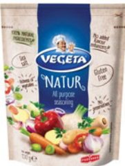
PODRAVKA 01280 VEGETA NATUR 12/150g UPC - 842826001447