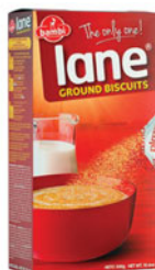
BAMBI 24002E GROUND LANE BISCUITS 14/300g UPC - 8600043003321