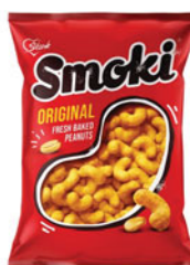
STARK 74006A SMOKI 20/150g UPC - 8600939506936