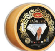
GLIGORA 21001 PASKI SIR 2/(2.5Kg APPROX) UPC - 3859891864041