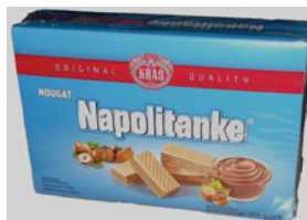
KRAS 03004 NOUGAT NAP. 10/500g UPC - 3850102322596