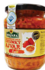
BILJANA 58018 CHUNKY AJVAR MILD 12/540g UPC - 733426027619