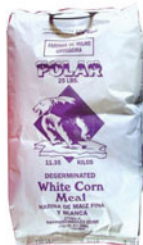
POLAR 78002 WHITE CORN FLOUR 25 LBS BAGS UPC -