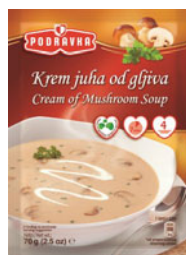
PODRAVKA 01047A CREAM OF MUSHROOM SOUP 18/54g UPC - 3850104274596