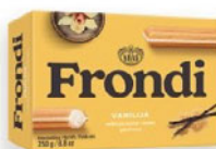
KRASM 03641 FRONDI MAXI VANILLA WAFER 28/250g UPC - 3870450001165