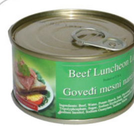
BS 63103 GOVEDI NAREZAK /BEEF LUNCH- EON 36/150g UPC - 094922973207