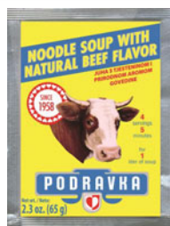
PODRAVKA 01002 NOODLE SOUP W/NATURAL BEEF FLAVOR 35/65g UPC - 3850104003134