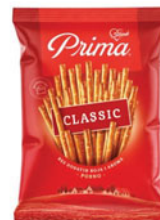
STARK 74027 PRIMA SALTY PASTRY 33/95g UPC -