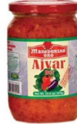
MAK-ORO 58242 MAKEDONSKO ORO HOT AJVAR 12/670g UPC - 733426015029