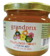
GP 66213 POLIFLOWER HONEY 12/500g UPC - 733426027725