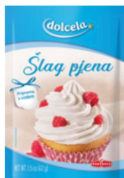
PODRAVKA 01078B B694S8/WHIP.TOPPING POWDER WATER 20/42g UPC - 3850104216947