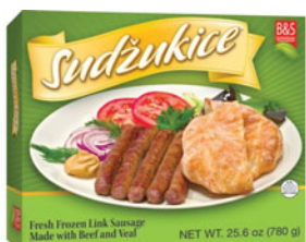
BS 63079 "SUDŽUKICE" FROZEN SAUSAGE 1.6 lbs UPC - 733426013025