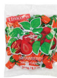
KRAS 03097 STRAWBERRY CANDIES 20/275g UPC - 733426012448