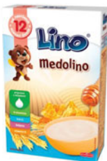
PODRAVKA 01043A MEDOLINO CEREAL 14/200g (E00858) UPC - 842826000273