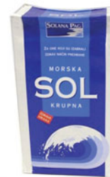
MORSKA SOL C COARSE SEA SALT SOL KRUPNA (MORSKA) 10/1kg UPC - 3859888155107