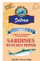
ORBE 54203 SARDINES W/HOT PEPP. IN VEG. OIL 50/124g UPC - 73342602720