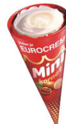
TAKOVO 25099 EUROCREAM MINI KORNET 15/65g UPC - 8601900501042