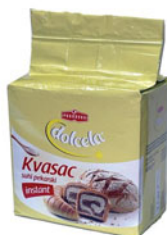
PODRAVKA 01336 DOLCELA INSTANT DRY YEAST 20/450g UPC - 3850104266027