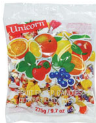
KRAS 03100 UNIC.FRUIT FILL.CANDY 20/275g UPC - 733426012479