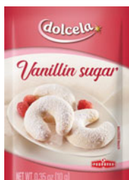
PODRAVKA 01026N VANILLA SUGAR 48/10G UPC - 3850104018862