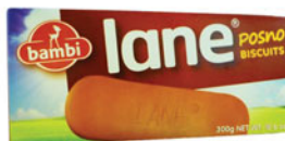
BAMBI 24045 BAMBI LANE LENTEN BISCUITS 12/300g UPC - 8600043023398