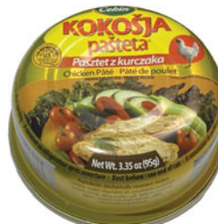
CEKIN 97504N CEKIN KOKOSJA PASTETA 48/95g NEW CAN UPC - 733426014688.