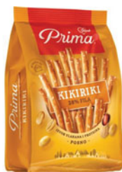
STARK 74029 PRIMA SALTY PASTRY WITH PEA- NUTS 12/230g UPC - 8600939212448