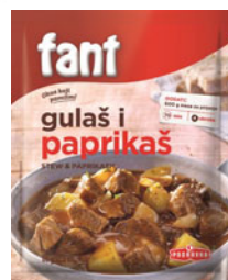
PODRAVKA 01009A SEAS.MIX FOR STEW AND PA 22/65g (A592S8) UPC - 842826000549