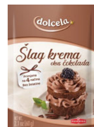
PODRAVKA 01020A B69158/WHIP.CREAM POWDER CHOC. 18/60g UPC - 3850104216916