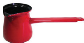
EMO 88011M COFFEE POTS 12/5cm UPC - 3838908026740