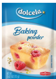
PODRAVKA 01027N BAKING POWDER/PRASAK ZA PECIVO 48/12g UPC - 3850104216770