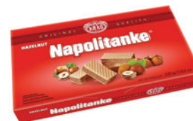
KRAS 03533 HAZELNUT WAFERS 12/330g UPC - 733426025295