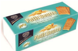
KRAS 03417 PETIT BEURRE 15/200g UPC - 3850102311163