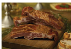
BS 63037 PORK RIBS( SVINJSKA REBRA) UPC -