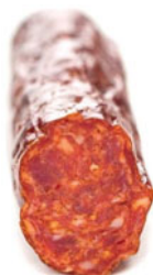
BS 63088 VOJVODZANSKI KULEN (LB) UPC -