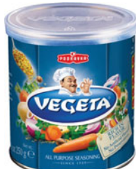
PODRAVKA 01107A VEGETA CANS 24/250g (D128S8) UPC - 842826000181