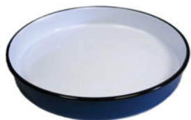
EMO 88003 DEEP BAKING TRAY 128/40cm- 6pcs UPC - 3838908022728