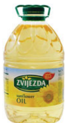
ZVJEZDA 014 SUNCOKRET ULJE 4/3 LIT. UPC - 733426014152