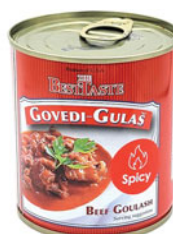
BS 63111 HUNGARIAN STYLE BEEF GOULASH SPICY 24/300g UPC - 94922973221