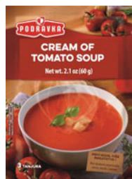
PODRAVKA 01238 CREAM OF TOMATO SOUP 18/60g UPC - 3850104274619