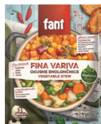
PODRAVKA 01319 (J145S8) FANT TASTY STEW 26/40G UPC - 3850104271458