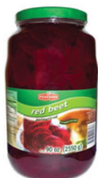
PODRAVKA 01095A CIKLA (RED BEET) 4/2550g UPC - 842826000808