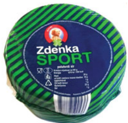
ZDENKA 80007 SPORT TRAPIST CHEESE (LB) UPC - 3858888590536