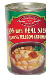
BS 63118 BEANS WITH SMOKED VEAL SAU- SAGE 24/425g UPC - 094922000651