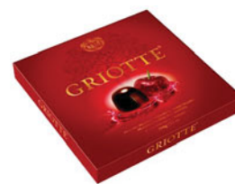
KRAS 03410B GRIOTTE 12/204g UPC - 3850102125821