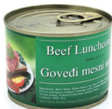
BS 63105 BEEF LUNCHEON LOAF/GOVEDJI NAREZ.36/200g UPC - 094922973306