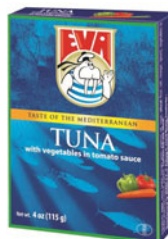
ADRIA 22039 EVA TUNA W/VEGETABLES IN SAUCE 30/115g UPC - 3859888140189