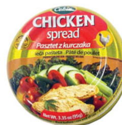
CEKIN 97511 CEKIN PILEKA PASTETA CHICKEN SPR 48/95g UPC - 733426027732