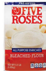
ADM 75003 FIVE ROSES FLOUR 10/5.5 LBS UPC - 068179601060