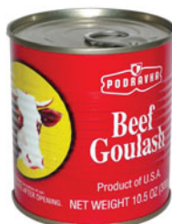
PODRAVKA 01137 BEEF GOULASH 24/300g UPC - 733426002203