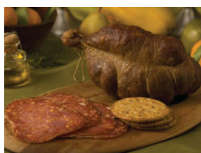
BS 63035 SLAVONSKI KULEN (LB) UPC -