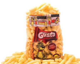
GUSTO 46918 CORN SALTY SNACKS 36/45g UPC - 6420211000332