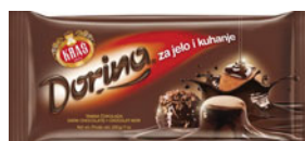
KRAS 03036 DORINA C. KUHANJE 12/200g UPC - 3850102113613