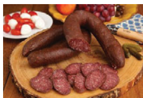
BS 63002 SMOKED BEEF SAUSAGE (BOSANSKI SUDZUK) UPC -