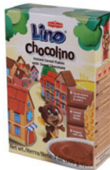
PODRAVKA 01035A COKOLINO CEREAL 14/200g (E00758) UPC - 842826000174