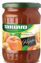
TAKOVO 25096 TAKOVO APRICOT MARMELADE 6/700g UPC - 8601900002419