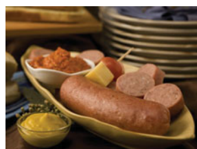
BS 63004 COOKED VEAL SAUSAGE (TELECA KRANJSKA) UPC -