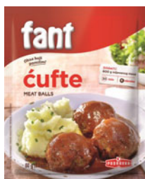
PODRAVKA 01241 FANT FOR MEAT BALLS (CUFTE) 20/60g UPC - 3850104248948