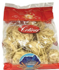
CETINA 39017 WIDE NOODLES NEST #20 15/400g UPC - 3858881682399