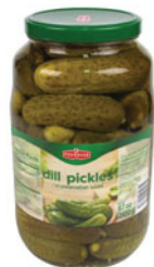
PODRAVKA 01086A KRASTAVCI DILL PICKLES 4/2450g UPC - 3850104222603