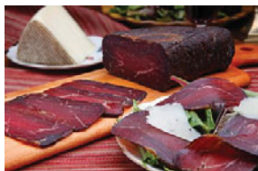
BS 63023 GOVEDA PRSUTA UPC -