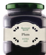
FOODLAND 24544 GRANNY SECRET EXTRA JAM PLUM 6/375g UPC -