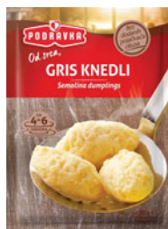
PODRAVKA 01245 GRIS KNEDLI 9/60g UPC -