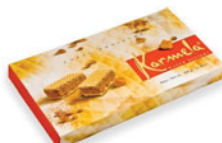
SLOBODA 04023A KARMELA WAFERS 13/400g UPC - 3850120300408