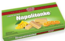
KRAS 03534 LEMON ORANGE WAFERS 12/330g UPC - 733426025301