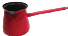
EMO 88009M COFFEE POTS 12/7cm UPC - 3838908026764