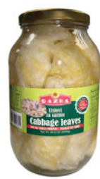
GAZDA 31027 CABBAGE LEAVES-LIST KUPUSA 6/2400g UPC - 73342602631