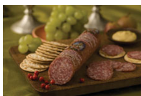
BS 63034 SMOKED PORK SAUSAGE( PORK CAJNA) UPC -