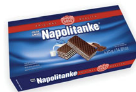
KRAS 03647 *BLOK* NAPOLITANKE COCOA & MILK 12/420g UPC - 3850102519125