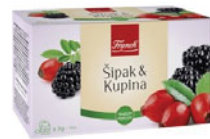
FRANCK 02125 CAJ ŠIPAK KUPINA (ROSEHIP BLACKB) 20/60g UPC - 3858881088801