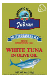
ORBE 54207 WHITE TUNA IN OLIVE OIL 50/113g UPC - 73342602724