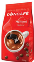
DONCAFE 34518 DONCAFE MOMENT (CLASSIC) 12/500g UPC - 8600101521675