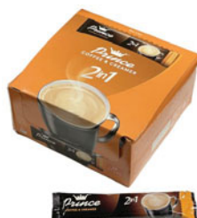
DEVOLLI 79008 DEVOLLI COFFEE & CREAMER (2in1) 10x24x10g UPC - 5310233008854