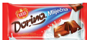
KRAS 03025 DORINA MLIJEČNA COKOLADA 30/80g UPC - 3850102111961