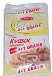
PODRAVKA 01335 INSTANT DRY YEAST 4+1 GRATIS 18/35g UPC - 3850104266577