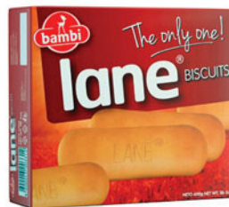
BAMBI 24003E PLAZMA LANE KEKS 6/600g UPC - 8600043003314