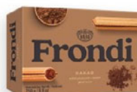
KRASM 03638 FRONDI MAXI COCOA WAFER 28/250g UPC - 3870450001189