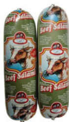
BS 63045 COOKED BEEF SAUSAGE (POSEBNA SALAMA) 2LB UPC -