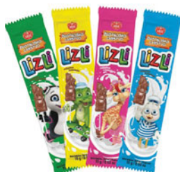
KRAS 03031S 11281104/ LIZLI MILK CHOCOLATE 50/15g UPC - 385000633