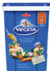
PODRAVKA 01178 VEGETA (PLASTIC CONTAINER) 6/2kg UPC - 842826000334