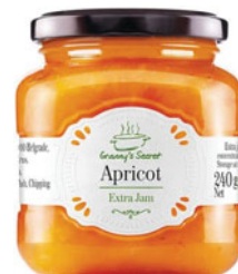
FOODLAND 24521 GRANNY SECRET APRICOT JAM 6/670g UPC - 8600103831833