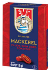
ADRIA 22056 EVA MACKEREL W/SUNDRIED TOMATO 30/115g UPC - 3856020234614