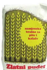
KLAS 34063 ZLATNI PUDER 8/2kg UPC - 3870004000040