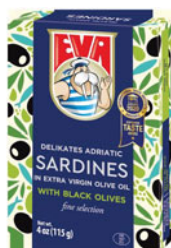
ADRIA 22042 SARDINES WITH BLACK OLIVES 30/115g UPC - 385602022703