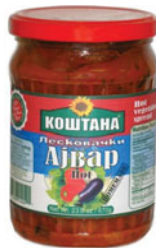
KOSTANA 58131 OLD VILLAGE AJVAR HOT 12/670g UPC - 733426014541