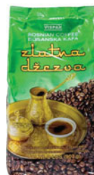
VISPAK 42006 ZLATNA DZEZVA 907g 10/2LBS UPC - 733426012974