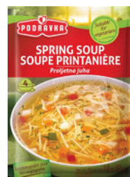
PODRAVKA 01003A SPRING SOUP 18/50g (042658) UPC - 842826000525