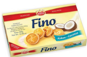
KRASM 03080 FINO KOKOS 12/300g (92265001) UPC - 3870450001301