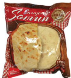
KLAS 88202 SOMUN FLAT BREAD 6/(5x230g) FROZEN UPC - 3870004011381