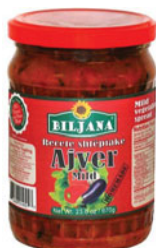
BILJANA 58011 SHTEPIAKE AJVAR MILD 12/670g UPC - 733426014558