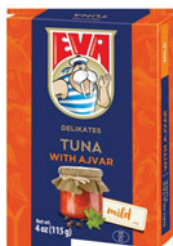
ADRIA 22054 EVA TUNA WITH AJVAR MILD 30/115g UPC - 385602023569