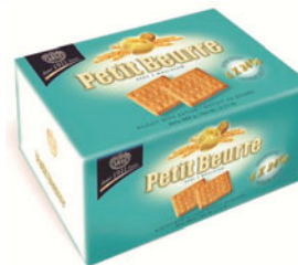
KRAS 03471 PETIT BEURRE BLOK 6/960g UPC - 3850102311446