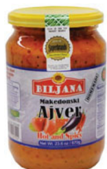
BILJANA 58048 MAKEDONSKI AJVER HOT AND SPICY 12/670g UPC - 733426027022