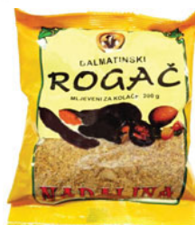
NADALINA 17102 GROUND CAROB/MLJEVENI ROGAC 12/200g UPC -