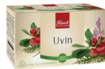
FRANCK 02119 FRANCK UVA URSI (UVIN) TEA 20/30g UPC -