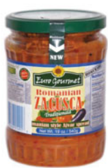
EUROG 58202 ROMANIAN AJVAR ZACUSCA 12/540g UPC - 733426014916