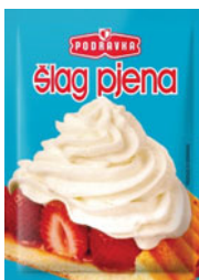
PODRAVKA 01077A B676S8/WHIPPED TOPPING POW- DER 22/36g UPC - 3850104216763