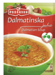
PODRAVKA 01140 DALMATIAN SOUP 19/60g (193858) UPC - 3850104003837