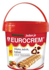
TAKOVO 25006 EUROCREAM 6/1kg UPC - 8601900504197