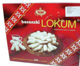
KLAS 34087 BOSNIAN LOKUM CAKE 12/400g UPC - 3870004004697