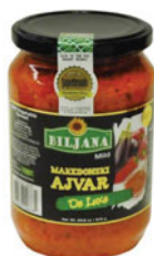
BILJANA 58035 DE LUXE AJVAR MILD 12/670g UPC - 733426026681