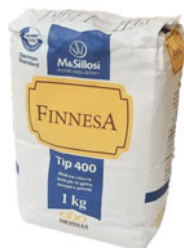
FINESSA 79101 FINESSA TIP 400 WHEAT FLOUR 10/1KG UPC - 3902208390266