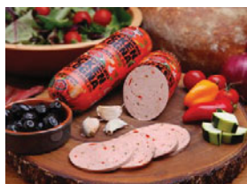
BS 63097 PILECI PARIZER SA POVRCEM 2lb UPC -