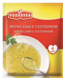
PODRAVKA 01360 CLEAR PASTA SOUP 16/45G UPC - 3850104270185