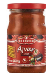
PODRAVKA 01089 AJVAR HOT (SMALL) 12/350g UPC - 842826001034