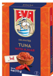
ADRIA 22055 EVA TUNA WITH AJVAR HOT 30/115g UPC - 3856020235390