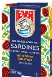
ADRIA 22043 SARDINES WITH DRIED TOMATO 30/115g UPC - 385602022642