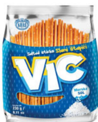
KRAS 03056 VIC SLANI STAPICI 12/230g UPC - 3850102314454