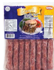
BS 63085 "CEVAPI" FROZEN SAUSAGE (CLEAR PAK) UPC -