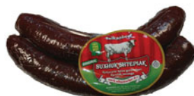
BS 63006 BALKAN BEEF SUKHUK SHTEPIAK (LB) UPC -