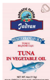
ORBE 54210 TUNA IN VEGETABLE OIL 50/113g UPC - 73342602727