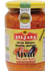
BILJANA 58047 'SHTEPIAKE AJVAR HOT AND SPICY 12/670g UPC - 733426026810