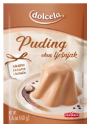
PODRAVKA 01162A PUDDING POWDER HAZELNUT 18/40g UPC - 3850104216732