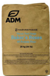
ADM 75001 BAKERS FIVE ROSES FLOUR 44 LBS 1 BAG UPC - 68179716504