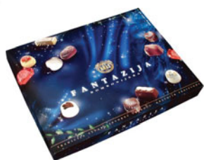
KRAS 03044 FANTAZIJA BOMBONIJERA 6/300g (11939301) UPC - 3850102514465