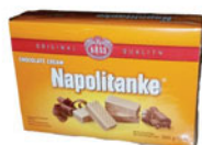
KRAS 03006 CHOC.CREAM NAP. 10/500g UPC - 3850102322909