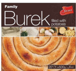
JAMI 89124 FAMILY BUREK POTATO 6/500g UPC - 3871832005696