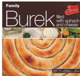
JAMI 89115 FAMILY BUREK SPINACH/CHEESE 6/500g UPC - 3871832005689