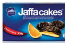
CRVENKA 73005 JAFFA CAKES (BLUE) 12/300g UPC - 860014000211