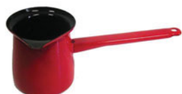
EMO 88012M COFFEE POTS 12/4cm UPC - 3838908026733