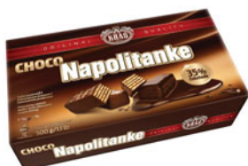
KRAS 03007 COKOLADNE NAPOLITANKE 12/500g UPC - 3850102320073