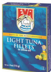
ADRIA 22038 TUNA FILLETS IN OLIVE OIL 30/115g UPC - 842826000983