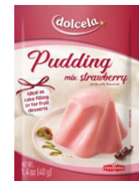
PODRAVKA 01066A B672S8/PUDDING STRAWBERRY 18/40g UPC - 3850104216725