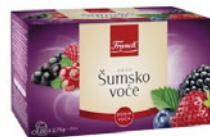
FRANCK 02018 FRANCK FOREST FRUIT TEA 20/55g UPC - 3858881083806