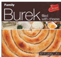
JAMI 89106 FAMILY BUREK CHEESE 6/500g UPC - 3871832005672