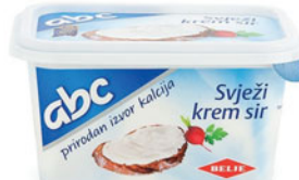
BELJE 99002 "ABC" CHEESE SPREAD 12/200g UPC - 3859888858336