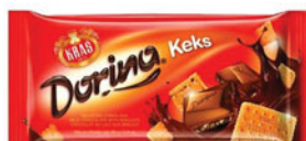
KRAS 03462 DORINA KEKS 28/80g UPC - 3850102117970