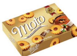
SLOBODA 04054 MOTO LJESNJAK 12/360g UPC - 3850120200197