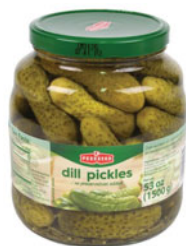
PODRAVKA 01031A DILL PICKLES 6/1500g UPC - 3850104222597