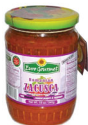
EUROG 58206 ZACUSCA WITH EGGPLANT 12/540g UPC - 733426025394