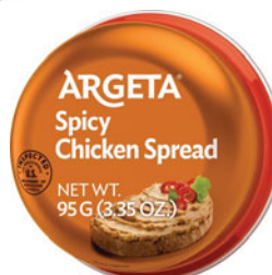
AG 98102 ARGETA CHICKEN SPREAD PI- QUANT 48/95g UPC - 733426027572