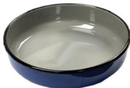
EMAILUL 46304 EMAILUL DEEP BAKING TRAY 6/36CM UPC -