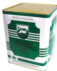
PHILI 15005 BULGARIAN SHEEP'S MILK CHEESE 12Kg TIN UPC -