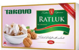
TAKOVO 25008 RATLUK ORAH 12/450g UPC - 8601900605368