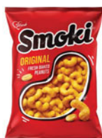
STARK 74002 (2A) 40 PCS of "SMOKI" FLIPS 40/50g UPC - 8600939506912