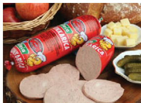
BS 63013 PILECA SUNKARICA CHICKEN ROLL 2LB UPC -