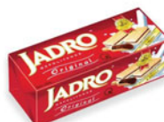
SLOBODA 04045 JADRO WAFERS 6/860g UPC - 3850120295865