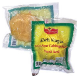
EUROG 58272 WHOLE SOUR CABBAGE HEADS 15kg UPC - 733426027756