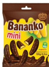
KRAS 03634A MINI BANANKO 10/120g UPC - 3860102126552