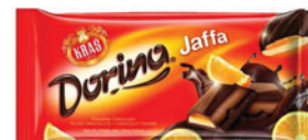
KRAS 03504 DORINA JAFFA CHOCOLATE 18/100g UPC - 3850102123827