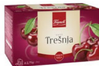
FRANCK 02094 TRESNJA CHERRY TEA 20/55g UPC - 3858881083783