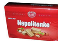
KRAS 03005 HAZELNUT NAP. 10/500g UPC - 3850102322916