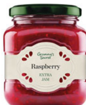
FOODLAND 24543 GRANNY SECRET EXTRA JAM RASPBERRY 6/375g UPC -