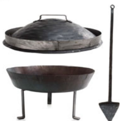
SAC SAC-SADAK-TEPSIJA (4 PIECE SET) UPC -