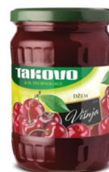
TAKOVO 25101 SOUR CHERRY MARMELADE 6/700g UPC - 8601900002440