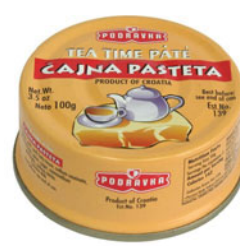
PODRAVKA 01138 60/100g CANS TEA TIME PATE UPC - 733426011823