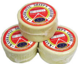
PHILI 15009 KASKAVAL 12/500g UPC -