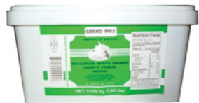
PHILI 15008 BULGARIAN SHEEP'S MILK CHEESE 24/0.400Kg UPC - 733426014985