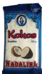
NADALINA 17101 DESSICATED COCONUTS KOKOS BRASNO 15/100g UPC - 3858881582057