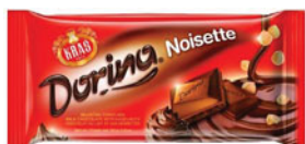
KRAS 03519 DORINA NOISETTE 30/80g UPC - 3850102125173