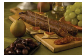
BS 63033 SMOKED PORK SAUSAGE (SREMSKA KOBASICA) UPC -