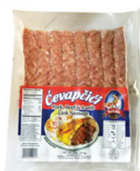
BS 63122 "CEVAPI" BEEF/PORK/LAMB 2 LB (CLEAR PAK) UPC -