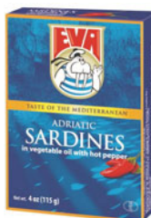
ADRIA 22034 SARDINES WITH HOT PEPPERS 30/115g/F09658 UPC - 842826000945