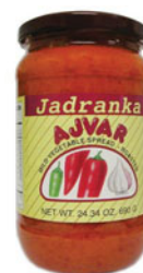
JADRANKA 14003 JADRANKA MILD AJVAR 12/670g UPC - 733426001206