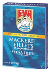
ADRIA 22035 MACKEREL FILLETS IN OIL 30/115g/ F09858 UPC - 842826000921