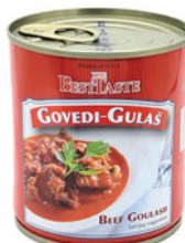
BS 63109 HUNGARIAN STYLE BEEF GOU- LASH 24/300g UPC - 094922973221