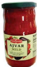
PODRAVKA 01030 AJVAR 12/690g UPC - 842826000426