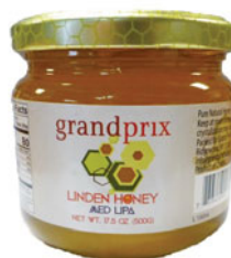
GP 66212 LINDEN HONEY 12/500g UPC - 733426027718