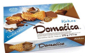
KRAS 03631 DOMACICA KOKOS 16/275g UPC - 3850102508709