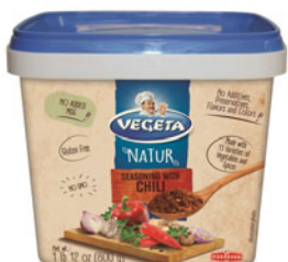
PODRAVKA 01366 VEGETA NATUR CHILI DOZA 6/800g UPC - 3856020221157