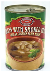
BS 63119 BEANS WITH SMOKED BEEF 24/425g UPC - 094922000637