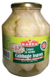
GAZDA 31018 CABBAGE LEAVES-LIST KUPUSA 6/1650g UPC - 733426011700