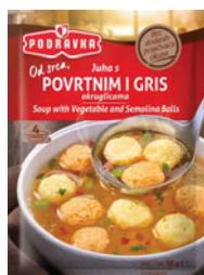
PODRAVKA 01358 SOUP WITH VEGET. AND SEMOL. BALLS 10/56G UPC - 3850104249686