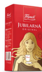
FRANCK 02020 JUBILARNA KAVA 24/250g UPC - 3850291015644