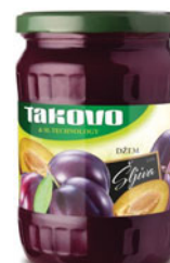
TAKOVO 25094 TAKOVO PLUM JAM 6/700g UPC - 8601900002433