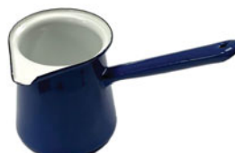
EMAILUL 46302 EMAILUL COFFEE POT 12/7CM UPC -