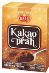
KRAS 03038 KAKAO U PRAHU 20/100g UPC - 3850102110292