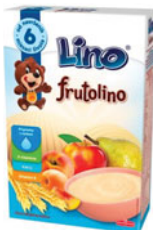
PODRAVKA 01034A FRUTOLINO CEREAL 14/200g (E00758) UPC - 842826000204