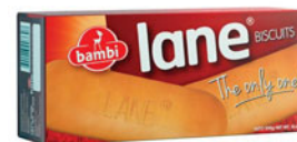
BAMBI 24004E PLAZMA LANE KEKS 12/300g UPC - 8600043003307