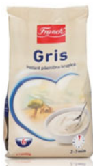
FRANCK 02108 INST. GRIS PSENICNA KRUPICA BAG 24/400g UPC - 3858881081598