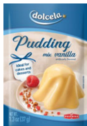
PODRAVKA 01065A J480S8/PUDDING VANILLA 18/37g UPC - 3850104216756