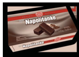
KRAS 03646 *BLOK* NAPOLITANKE COCOA & CHOCO 12/420g UPC - 3850102519118