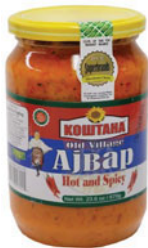
KOSTANA 58135 OLD VILLAGE AJVAR HOT AND SPICY 12/670g UPC - 733426027015