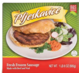
BS 63090A BEEF GOVEDJE PLJESKAVICE 32 x 1.5 lb UPC -