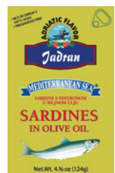
ORBE 54204 SARDINES IN OLIVE OIL 50/124g UPC - 73342602721