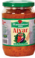
MAK-ORO 58241 MAKEDONSKO ORO MILD AJVAR 12/670g UPC - 733426015012