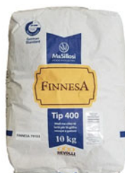
FINESSA 79103 FINESSA TIP 400 WHEAT FLOUR 10KG UPC - 3902208390686