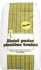
KLAS 34055 ZLATNI PUDER 10Kg UPC - 3870004000026