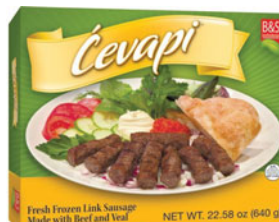
BS 63080 "CEVAPI" FROZEN SAUSAGE 1.6 lbs UPC - 733426013018