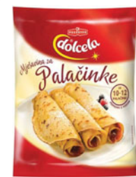
PODRAVKA 01240 PANCAKE MIX (ZA PALACINKE) 16/200g UPC - 3850104237874