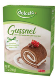
PODRAVKA 01081A GUSNEL / STARCH 9/200g (H538S8) UPC - 3850104219467.