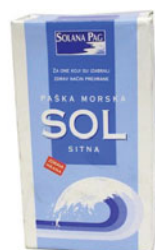
MORSKA SOL F FINE SEA SALT SOL SITNA (MORSKA) 10/1kg UPC - 3859888155114