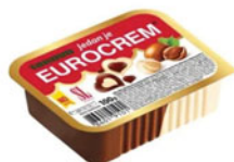
TAKOVO 25012 EUROCREAM SPREAD 36/100g UPC - 86019101