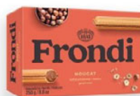
KRASM 03640 FRONDI MAXI NOUGAT WAFER 28/250g UPC - 3870450001196