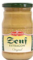
PODRAVKA 01042 ESTRAGON MUSTARD 12/350g UPC - 842826000853