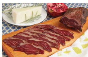
BS 63087 KRASKI SUHI SVINJSKI VRAT/ SMOKED BUTT UPC -