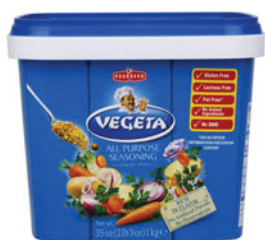
PODRAVKA 01177 VEGETA (PLASTIC CONTAINER) 6/1kg UPC - 842826000341