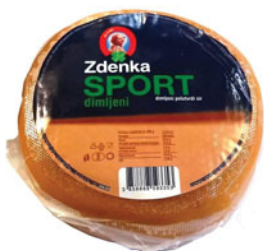
ZDENKA 85140 SEMI HARD SMOKED CHEESE SPORT 8/cca 600G UPC - 2100502009186