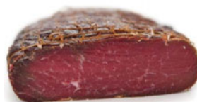
BS 63089 SVINJSKA PRSUTA (LB) UPC -