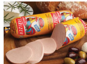
BS 63003 CHICKEN BOLOGNA (PILECI PARIZER) 2x1LB UPC -