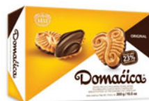
KRAS 03083A COKOLADNA DOMACICA 16/300g UPC - 3850102314126