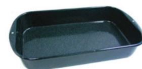
EMO 88016 (105) BAKING PAN 8/36cm UPC - 26948