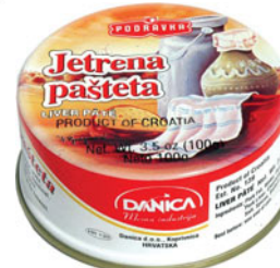
PODRAVKA 01005 LIVER PATE 60/95g UPC - 733426002302