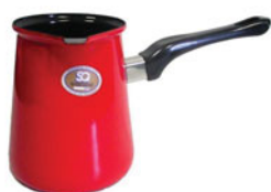
EMO 88007M COFFEE POTS 6/12cm UPC - 3838908026726