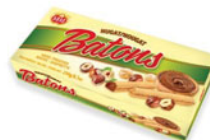
KRAS 03008 BATON NOUGAT 12/250g (32425601) UPC - 3850102321674