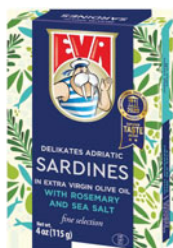
ADRIA 22041 SARDINES W/ ROSEMARY & SEA SALT 30/115g UPC - 385602022673