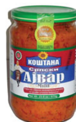
KOSTANA 58133 SERBIAN AJVAR MILD 12/670g UPC - 733426026513