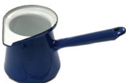
EMAILUL 46301 EMAILUL COFFEE POT 12/6CM UPC -