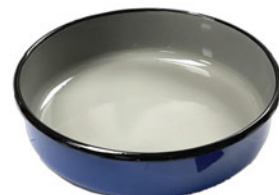
EMAILUL 46303 EMAILUL DEEP BAKING TRAY 6/32CM UPC -