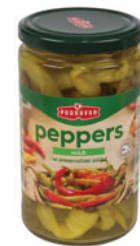
PODRAVKA 01094 FEFERONI MILD 12/600g UPC - 842826000730