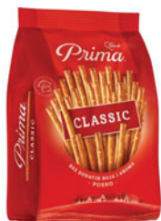
STARK 74011 PRIMA STAPICI 12/220g UPC - 8600939212271