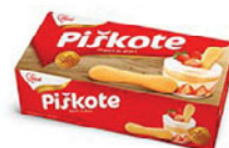
STARK 74005 PISKOTE 15/210g UPC - 8600939130858