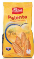
FRANCK 02109 INST. PALENTA KUKUR. KRUPICA BAG 24/450g UPC - 3858881080744