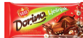
KRAS 03575 DORINA S LJESNJAKOM 30/80g UPC - 3850102501526