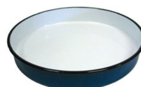
EMO 88002 DEEP BAKING TRAY 128/36cm- 6pcs UPC - 3838908022711