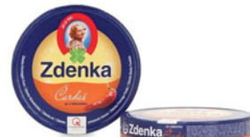
ZDENKA 80002B (SLEEVE) CARDAS HOT ZDENKA 16/140g UPC - 3858888590109