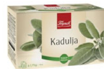
FRANCK 02118 CAJ KADULJA (SAGE TEA) 20/35g UPC - 3858881087583