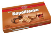
KRAS 03535 RUM WAFERS 12/330g UPC - 733426025332