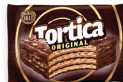
KRAS 03029 COKOLADNA TORTICA 72/25g UPC - 3850102320011