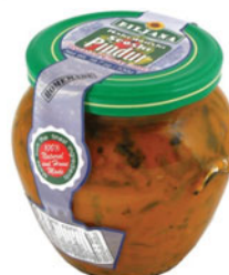
BILJANA 58015 'SEOSKI PINDJUR (AMFORA) 12/530g UPC - 733426014596