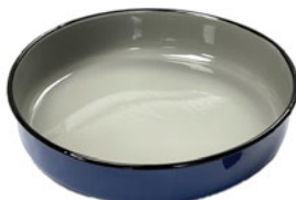
EMAILUL 46305 EMAILUL DEEP BAKING TRAY 6/40CM UPC -