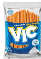
KRAS 03013 VIC SLANI STAPICI 60/50g (31157001) UPC - 3850102311576