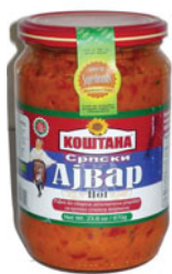
KOSTANA 58134 SERBIAN AJVAR HOT 12/670g UPC - 733426026520