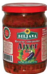
BILJANA 58012 SHTEPIAKE AJVAR HOT 12/670g UPC - 733426014565