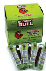
BS 63130 HALAL BEEF STICK 6" 240/0.9 oz UPC -