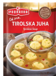
PODRAVKA 01357 TYROLESE SOUP 10/67g UPC - 3850104402340