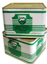
PHILI 15004 BULGARIAN SHEEP'S MILK CHEESE 2/6Kg TIN UPC -