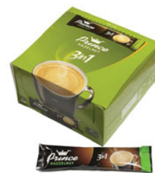
DEVOLLI 79010 PRINCE HAZELNUT COFFEE (3in1) 10x24x18g UPC - 5310233009165