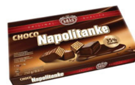
KRAS 03087 COKOLADNE NAPOLITANKE 12/250g UPC - 3850102320080