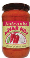
JADRANKA 14004 JADRANKA HOT AJVAR 12/670g UPC - 733426001800