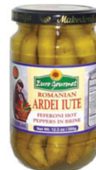
EUROG 58208 ARDEI IUTE FEFERONI HOT 12/350g UPC - 733426025462