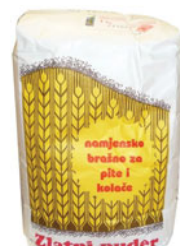
KLAS 34065 ZLATNI PUDER 10/1kg UPC - 3870004000019