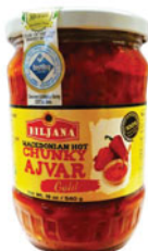
BILJANA 58019 CHUNKY AJVAR HOT 12/540g UPC - 733426027671