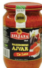
BILJANA 58036 DE LUXE AJVAR HOT 12/670g UPC - 733426026698