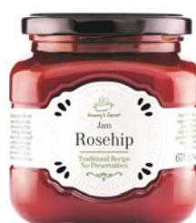
FOODLAND 24506 GRANNY SECRET ROSE HIP JAM 6/670g UPC - 8606011032966