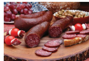
BS 63038 SMOKED BEEF SAUSAGE( AL- BANSKA SUDZUKA ) UPC -