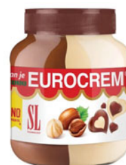
TAKOVO 25004 TAKOVO EUROCREAM 6/800g UPC - 8601900503442