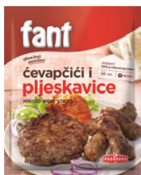
PODRAVKA 01008A SEAS.MIX FOR MINC.MEAT S 24/40g (A553S8) UPC - 842826000679