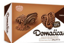
KRAS 03599 DOMACICA TAMNA DARK CHOC BISCUIT 16/275g UPC - 3850102501779