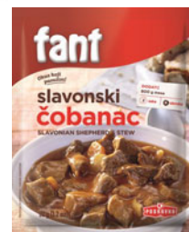
PODRAVKA 01231 FANT ZA SLAVONSKI COBANAC 14/90g UPC - 842826001133