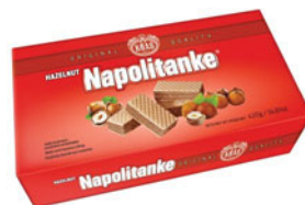
KRAS 03557 *BLOK* NAPOLITANKE HAZELNUT 12/420g UPC - 3850102326167