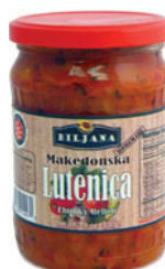
BILJANA 58002 LUTENICA "CHUNKY HOT RELISH" 12/540g UPC - 733426014480