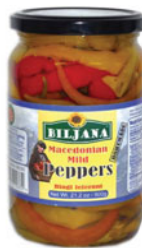
BILJANA 58030 FEFERONI MILD PEPPERS 12/600g UPC - 733426026339