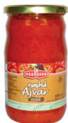
PODRAVKA 01283 ROASTED AJVAR MILD 12/690g UPC - 842826001638