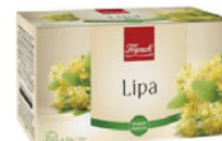
FRANCK 02003 LIPA DOMACI CAJ 20/40g [1499] UPC - 3850291016481