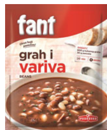
PODRAVKA 01011A SEAS.MIX FOR BEANS 20/60g (A559S8) UPC - 842826000754