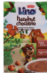
PODRAVKA 01036A HAZELNUT COKOLINO 14/200g (E00558) UPC - 842826000280