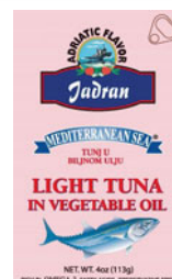
ORBE 54209 LIGHT TUNA IN VEG. OIL 50/113g UPC - 73342602726