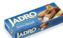
SLOBODA 04046 JADRO KOKOS-COKO WAFERS 14/430g UPC - 3850120297432