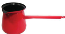
EMO 88008M COFFEE POTS 12/8cm UPC - 3838908026771